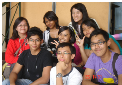
Anda pasti RUGI jika anda tidak datang