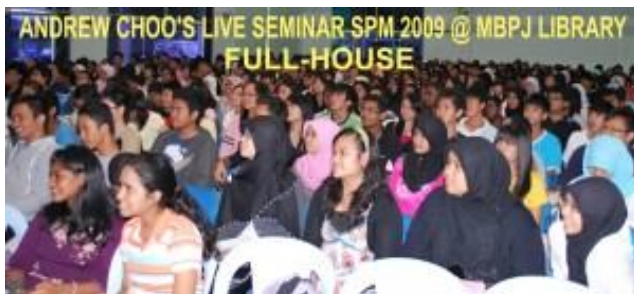
SEMINAR SPM 2009 SEEING IS BELIEVING